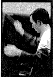
Our conductor extraordinaire in action

Also, many concert themes and ideas come from player suggestions within the orchestra. Students are behind every aspect of the making of a Pops concert, and whether a member is on the Board or not, each and every one is important and indispensable to the running of the orchestra.