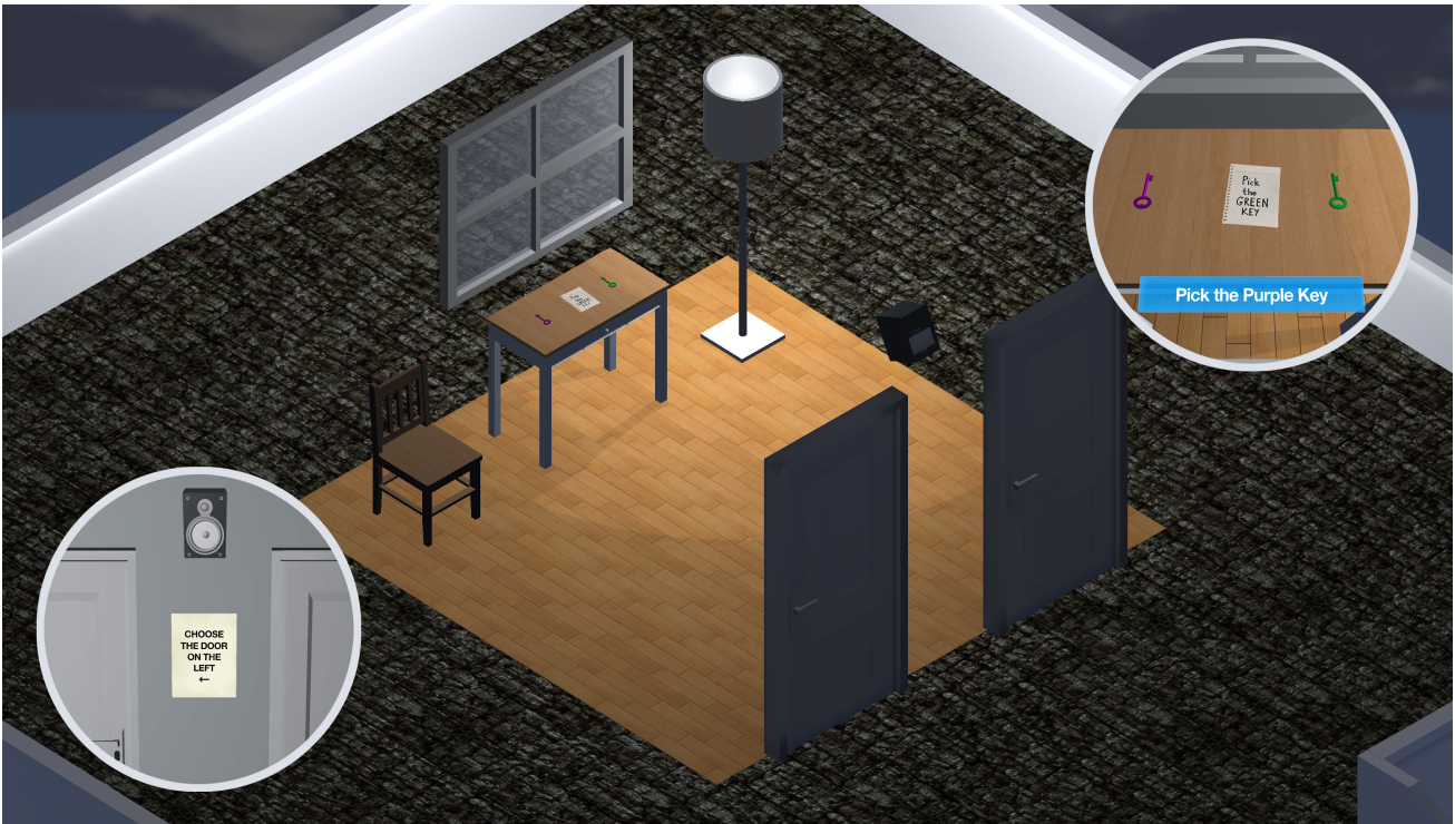
Figure 1. An isometric view of the virtual room where the user study was conducted with its surrounding walls removed for this image. The user is tasked with picking a key and choosing a door to exit the room; while doing so, they are presented with conflicting suggestions in the form of diegetic and non-diegetic audio and visual cues.

cations [5]. Today, VR is viewed as a suitable platform for conducting behavioral studies including those that pertain to psychophysical operations [6,7] and decision-making [8–10]. Whereas previous projects have utilized VR simulations to study decision-making processes in life-critical situations [11,12], the current project adopts a user-experience approach to the study of decision-making in VR.