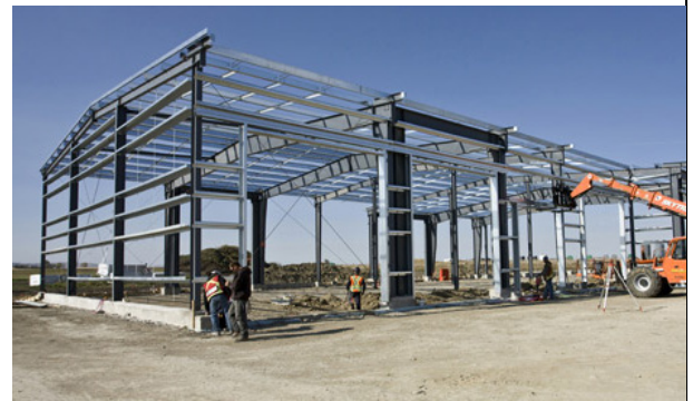
Figure 4 - But NOT this sort.

3. READINGS – All readings are required ; the seminar functions only when everyone has the same baseline knowledge, accumulated over the semester. Most readings are in the textbook. The goal is not to accumulate lots of facts. It is not to memorize. Rather, it is to identify key ideas, concepts, biophysical, psychological, and social contexts, and to generate principles, all as they relate to localization. To facilitate discussion, students should prepare comments and questions and do so before each class (these notes can also be submitted as an assignment on Canvas if you did not find the opportunity to participate in class discussion. Consult with GSI for submission details). Consider the following strategy: