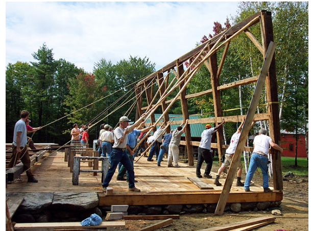
Figure 2 - This sort of barn raising.

A. FREE-FOR-ALL: There is a prize out there in the middle of the floor. It may be the instructor's approval or it may be one's own self-esteem, but it's there and the goal is to win it, and anything goes. You win by looking not just smart, but by looking smarter. And that means it's just as important to make others look dumb as to make you look smart. The main tool is