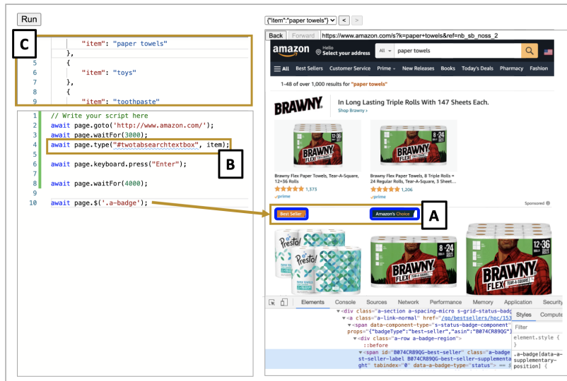
Fig. 1. Our prototype web automation IDE. As programmers write their script, they can inspect and interact with the target website within the IDE to identify desired UI elements. When the programmer types a CSS selector on line 10, the matching UI elements on the website are highlighted in blue (A). Feedback on CSS selectors also appears inline – the blue squiggle under #twotabsearchtextbox indicates it is found and unique (B). The programmer can also run and test their script on different user inputs (C).