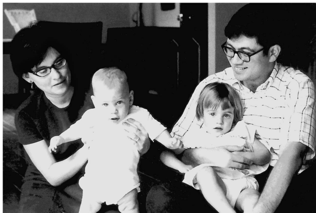
FIG. 12. The young Nancy and Peter Bickel, and their daughter and son Amenda and Stephen. This picture was used as a New Year’s greeting card.

My father was born in Bukovina, a German speaking province of the Austro-Hungarian Empire. He had a traditional Jewish and then a secular education. In high school, under the influence of one of the high school